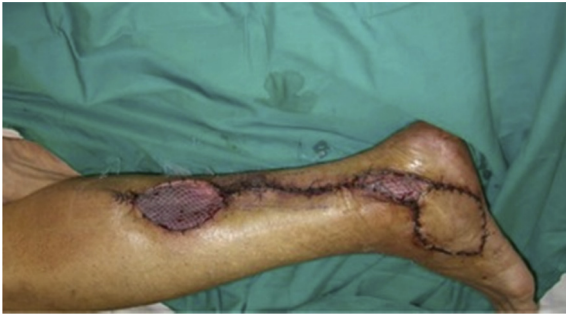
Figure 5. After the operation: donor site and the open tunnel covered with partial thickness skin graft.