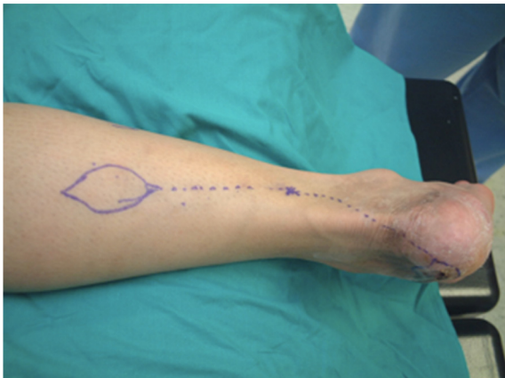
Figure 1. Preoperative planning with pivot point marked.

Tourniquet was applied without exsanguination. The proximal margin was dissected first. The deep fascia was incised. The lesser saphenous vein, the sural nerve and the median superficial sural artery were identified and included in the flap (Figure 2). Anchoring stitches were placed to avoid separation of skin and fascia. The flap was elevated from proximally to distally with longitudinal strip of fascia containing the nerve, the vein and the accompanying artery. The skin extension was left over the pedicle. The width of the adipofascial pedicle was ~3 cm, and the pedicle dissection stopped at the pivot point that was at least 5 cm above the lateral malleolus