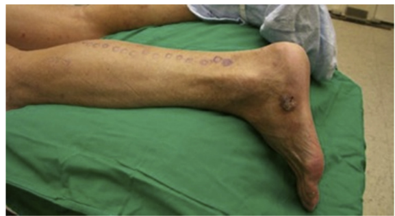
Figure 3. Case of basal cell carcinoma over lateral foot in preoperative planning.

Postoperatively, a dorsal plaster of Paris slab was applied for 2 weeks to keep the ankle in plantar flexion so as to decrease stretching of the pedicle. The operated leg was elevated without pressure on the vascular pedicle. We also marked “No Pressure” in red on the dressing surface overlying the area of the flap. This helps to remind the nursing staff not to put the foot on the bed or a pillow, which may press onto the pedicle or flap. Dextran 40 infusion (in 500 mL normal saline) over 4 hours daily was given for 3 days. Nonweight bearing was prescribed for 4 weeks in total (Figure 6).