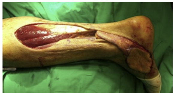
Figure 4. Rotating the sural flap in an open tunnel to cover the excised wound defect.