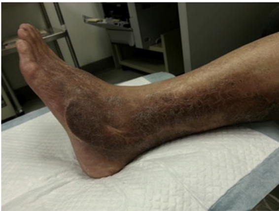
Figure 6. Postoperative 5 years: wound, well healed.